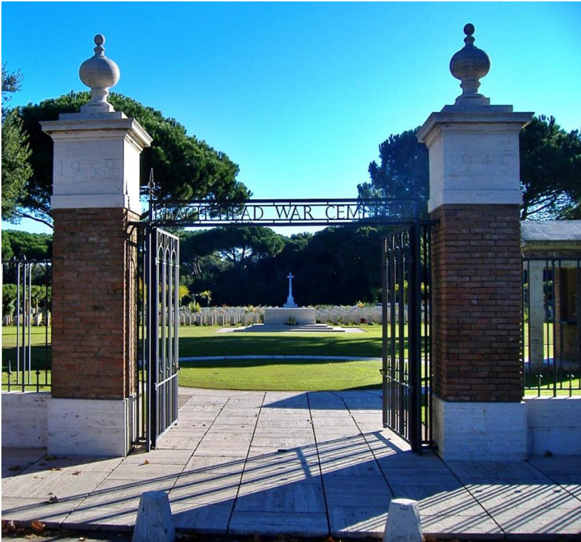
Beachy Head War Cemetery, Anzio